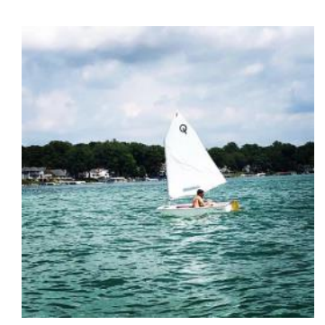
***NEW THIS YEAR***

SUMMER SAILING PASS—8 CLASSES $200 Transferable to any or multiple family members, any days, any skill level. Advanced notice required.